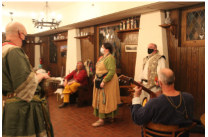
The Bardic Championship Competition