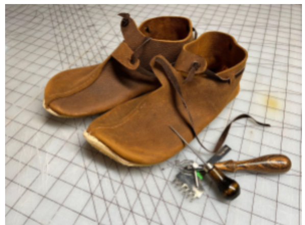
Viking turn shoes made by Dragmall Viðnir.