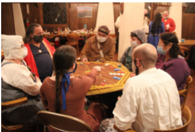
Competitors in the Gaming Championship