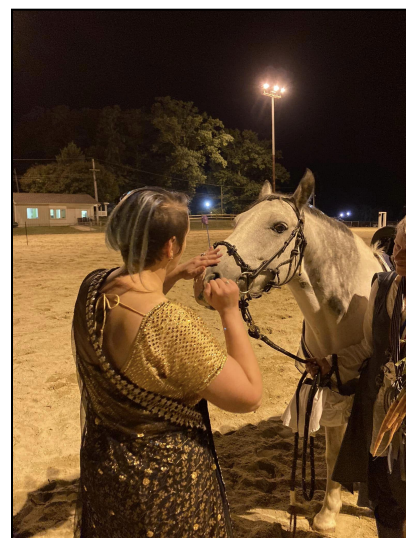
10. Mica, war pony of Bhakail, competed in his first SCA equestrian event at Olympic River Wars, and received treats from the Consort as his reward.