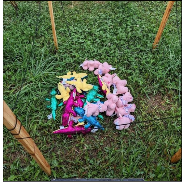
2. The camps of Bhakail, the Barony of Settmour Swamp and the pirate ship Ravenspittle played a game that involved protecting herds of native animals while trying to obtain the animals from the other camps. Bhakail had salamanders, Settmour Swamps had pigs and Ravenspittle had parrots. As shown, the Bhakail pen wound up with the most animals at the end of the game, winning us many wonderful prizes of gems, rings, bracelets, furs and more.