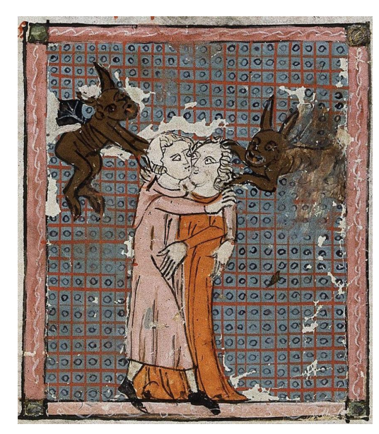
Detail of a miniature of a temptation by lechery. Image taken from f. 33 of Breviari d'Amor. Written in Occitan.